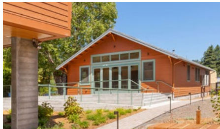
▲ Russian River Resiliency Center