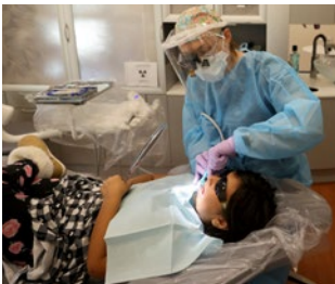
▲ Dental patient at the RRHWC Guerneville

At its core all of health care is relational. Primary Health Care must offer a continuous, trusting, “first-name” relationship with patients. Every interaction creates opportunities for empowering patients and staff to build healthy communities.