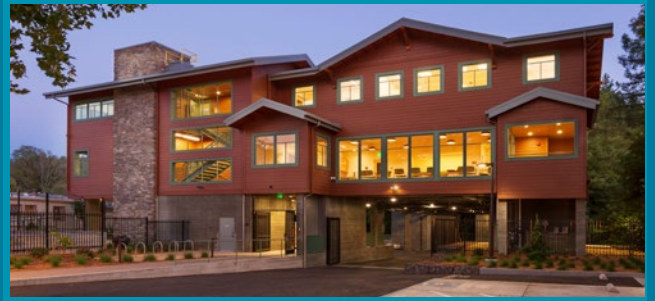
▶ Russian River Health & Wellness Center