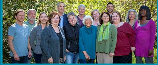
▶ West County Health Centers 2020 Board of Directors

Caring for our Communities a californihealth + center