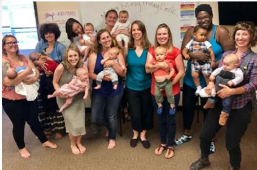
◀ WCHC Comprehensive Perinatal Services Program — Mother Rising Circle, a group for new moms and babies

At its core all of health care is relational. Primary Health Care must offer a continuous, trusting, "first-name" relationship with patients. Every interaction creates opportunities for empowering patients and staff to build healthy lives and communities.