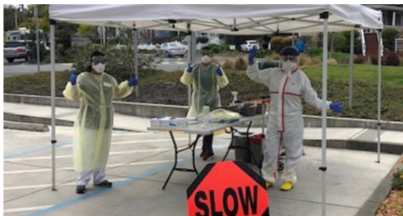
▲ WCHC Staff Set-up for Curbside Drive Thru Testing at the Gravenstein Community Health Center.