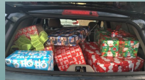
One of the many car trips.